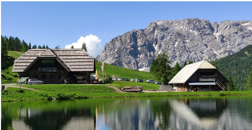
Watschiger Alm with Roßkofel