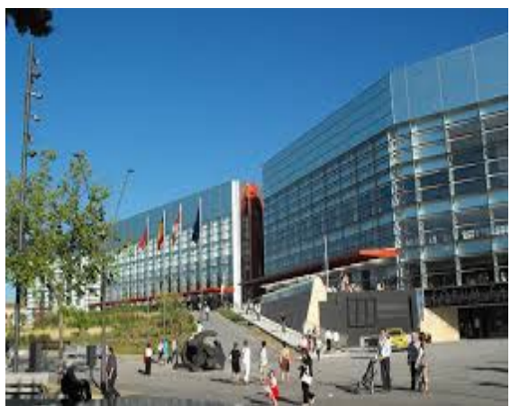
PALACE AND MUSEUM OF EVOLUTION