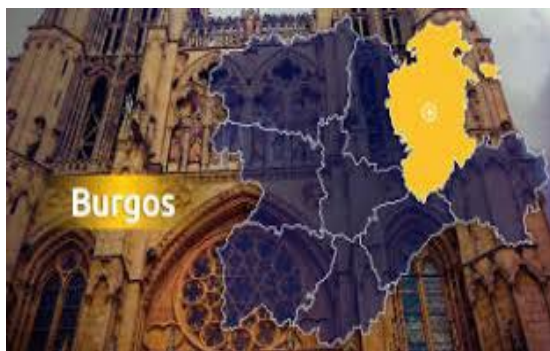
COMMUNITY OF CASTILLA Y LEON