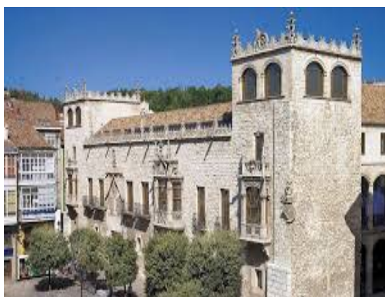
CASA DEL CORDON