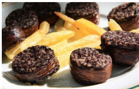
MORCILLA DE BURGOS