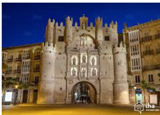
SAINT MARIE'S ARCH