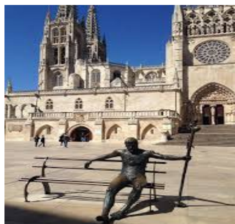
PILGRIM (THE CATHEDRAL)

VIII CENTENARY OF THE CATHEDRAL OF BURGOS, I TORNEO INTERNACIONAL DE FUTBOL SEVEN FOR SECURITY FORCES AND BODIES. DOSSIER PRESENTATION 20 TEAMS.