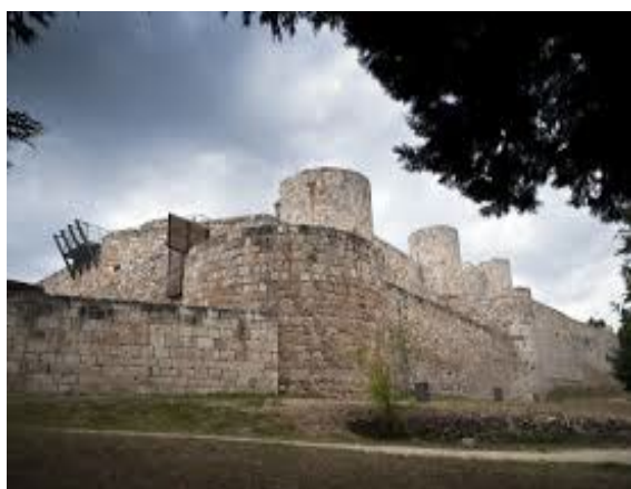
CASTLE OF BURGOS