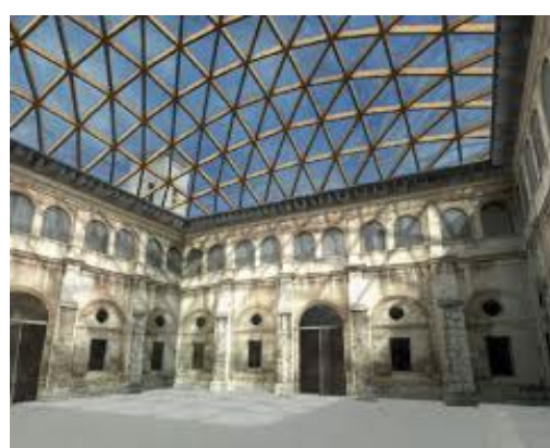
MONASTERY OF SAN JUAN AND ITS INTERIOR (OPENING CEREMONY TOURNAMENT)