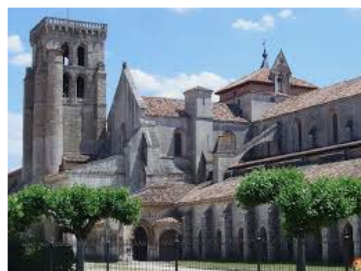
MONASTERY OF THE ROYAL STRIKES