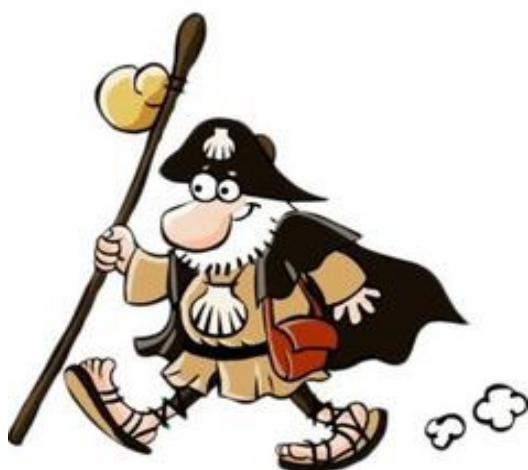
YEAR OF XACOBEO 2022