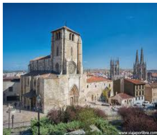
CHURCH OF SAN ESTEBAN