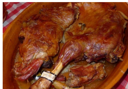
ROASTED LAMB FROM BURGOS

VIII CENTENARY OF THE CATHEDRAL OF BURGOS, I TORNEO INTERNACIONAL DE FUTBOL SEVEN FOR SECURITY FORCES AND BODIES. DOSSIER PRESENTATION 20 TEAMS.