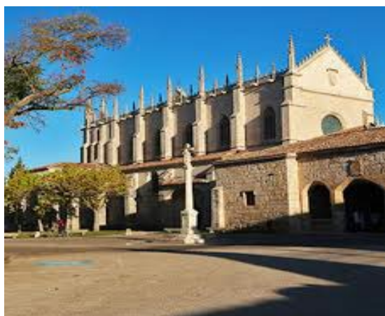
CARTUJA OF MIRAFLORES