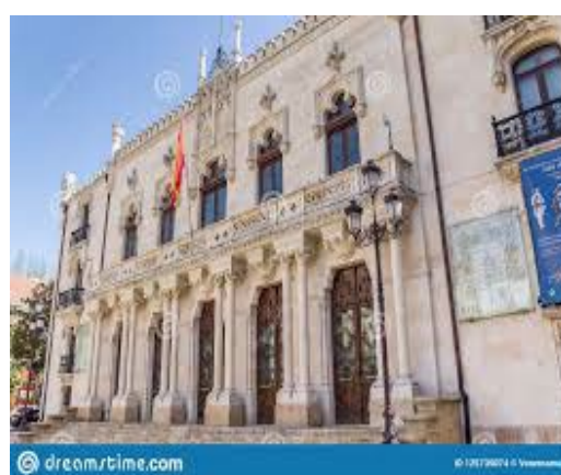
SUPREME TRIBUNAL OF JUSTICE