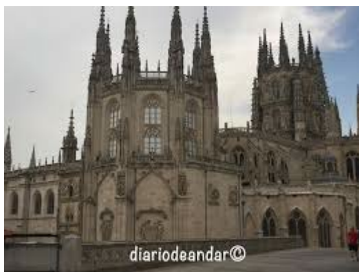
CATHEDRAL OF BURGOS VIII CENTENARY