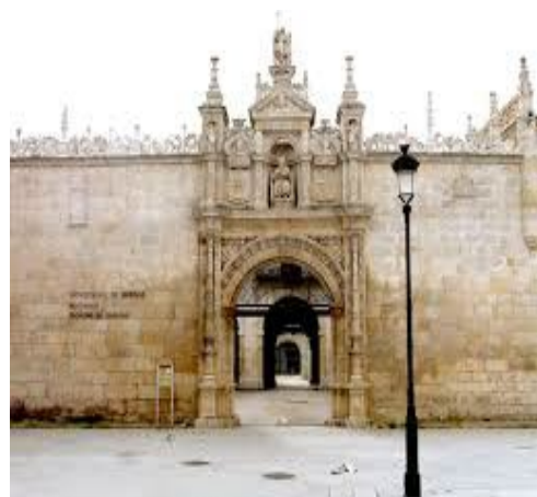
UNIVERSITY OF BURGOS