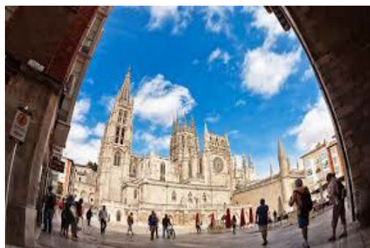
CATHEDRAL VIEW FROM SAINT MARIE'S ARCH